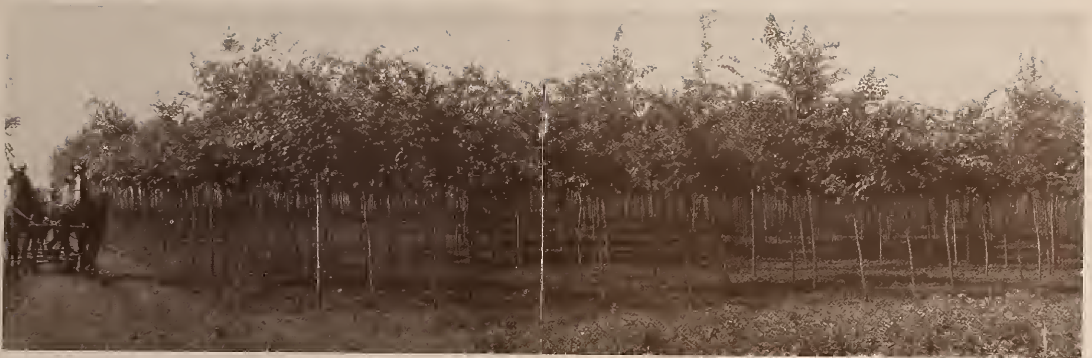
Block of specimen Elms, two to three inch twice transplanted and spaced five feet by five feet.